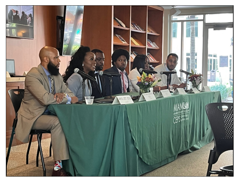
Miami Law's <u>Center for Ethics and Public Service</u> honored the Civil Rights Collective with the annual Lawyers in Leadership Award on Thursday, September 8, 2022.