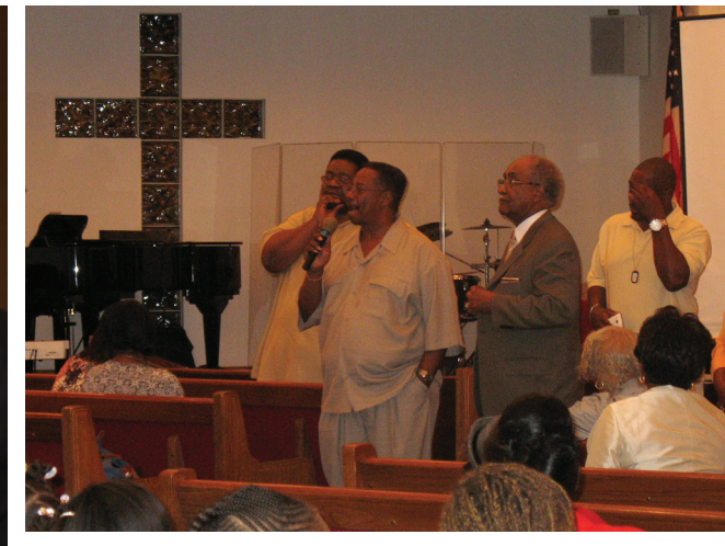
Coconut Grove Ministerial Alliance members speaking at the Historic Black Church Program Oral History Project documentary film screening at Greater St. Paul Á.M.É. Church.